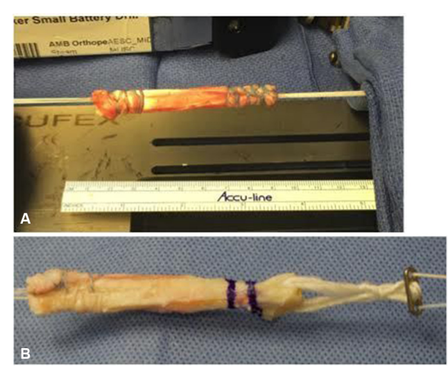
Figure 1 (A) Soft tissue-only quadriceps tendon autograft and (B) quadriceps tendon autograft harvested with a patella bone block.

of sufficient diameter and length to accommodate ligamentous reconstructions.